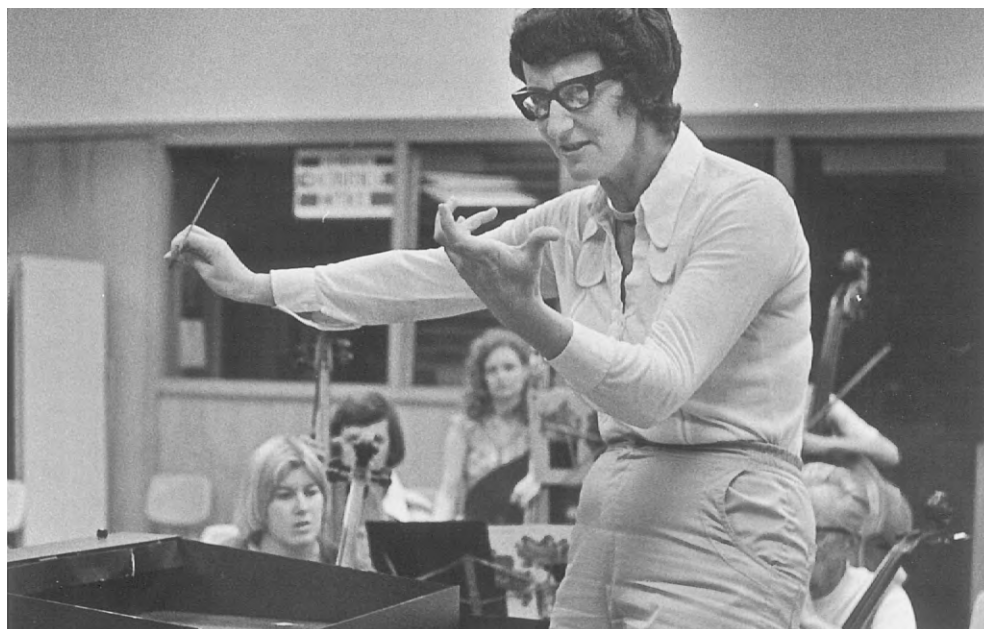
Thea Musgrave rehearsing her Viola Concerto , 1973.

For information about Thea Musgrave's operas, choral & vocal works visit theamusgrave.com & wisemusicclassical.com